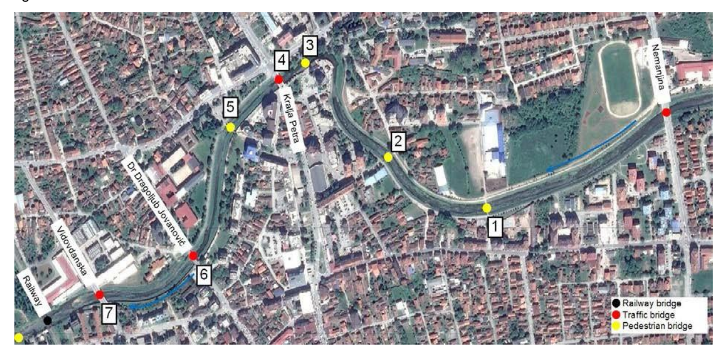
Figure: Bridges in Paracin city center

Scope of the project is preparation of Construction design and construction of two traffic bridges on Crnica river located in the city center of the Paracin (river chainage from km 6+060 to km 5+616). Construction permits are issued by the Municipality of Paracin for bridges 4 and 6, See figure below.